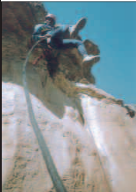
Scout Bongo Ndzutha taking advantage of the Absailing Base at the camp.